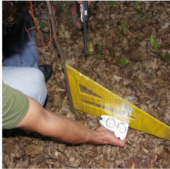
Fig.1 Taking the azimuth for each seedling, before cutting it

The first clue to count was the well-known higher quality of the timber harvested from the old-growth forests, where trees usually have straight stems, without any first-order branches, which would diminish the height growth, resulting a zigzag shape of the stem. When this kind of stem occurs, it indicates, that the height growing process was carried out by different first-order branches, and not by a single apical meristem, as it happens, for instance, with all resinous species. Hence the first traits are worth to take note the dominant stem branched-out and one of the branches undertook the role of dominant main stem (which actually is an assignation of the dominant growth to another branch). Another aspect was the annual unit of growth, identified for each seedling, and its seasonal components (internodes), described in the first section of this article.