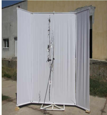
Fig. 3 Fastening the seedlings in preparation for photography

In order to produce the 3D virtual image of each sapling, used further for assessing the volume and the total interception area of crown, each sapling fixed in a special device was photographed, presented in Fig.3.